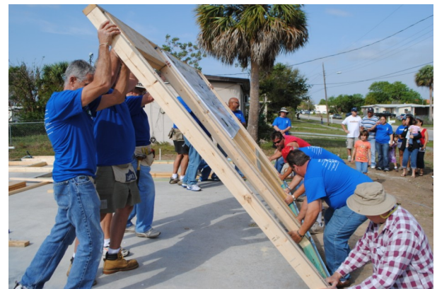
Apostles Build 2011 Team Members Putting "Faith into Action"

This house will begin late 2011. If you belong to a church that might be