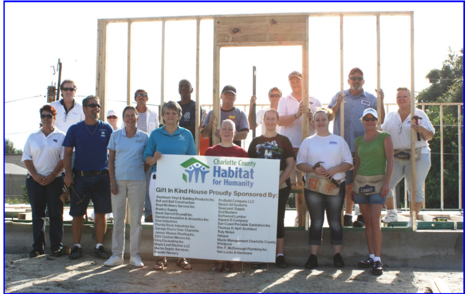
Our Gift In Kind Sponsors raised the walls on September 10, 2011!

Thank you for your generous donations that make the American Dream a reality for low-income families in Charlotte County!