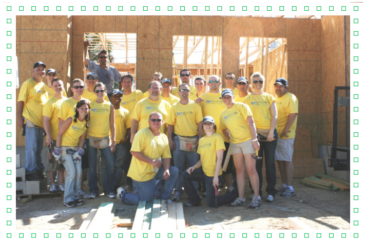
A few of our "celebrity" volunteers - Tampa Bay Rays

*Contributions are tax deductible as allowed by law